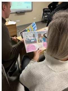
Piloting in Lithuania