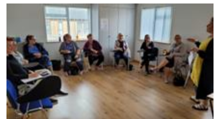
Piloting in United Kingdom