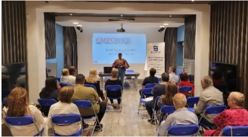
Multiplier event in Malta

We are sharing some moments from multiplier events below.