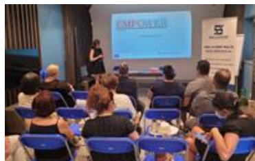
Piloting in Malta