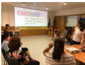
Piloting in Portugal

All the partners successfully organized piloting events of all four intellectual outputs. Some of the events were held face to face while other had to be done online. We received very positive and constructive feedback. Below you can see a few pictures from the piloting events in partner countries.