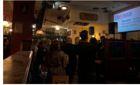
Multiplier event in Germany